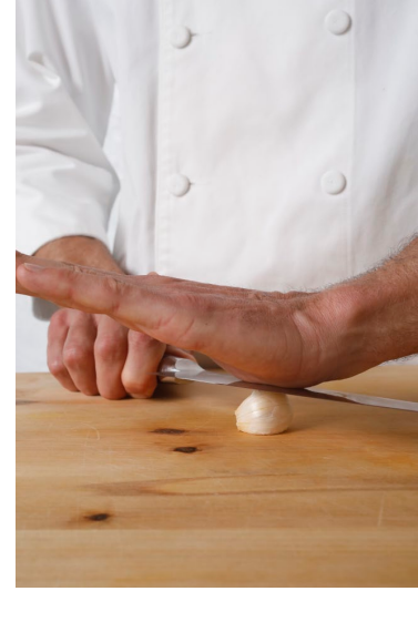
2. Place the side of a chef's knife on a garlic clove with the blade angled down and pointing away. With your fingers safely extended away from the blade, use the heel of your palm to lightly crush the clove.