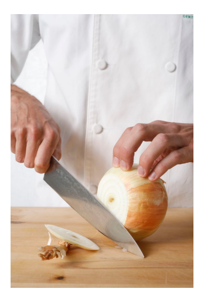
1. Cut off the top of the onion, leaving the root end (with the hair) intact.