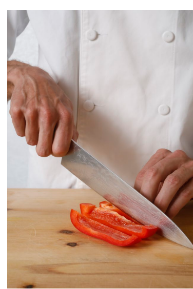
4. With the skin side down, slice 1/2 to 3/4-inch strips, lengthwise.