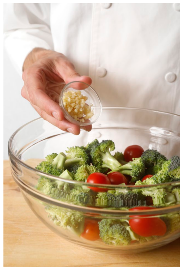
3. Add the minced garlic.