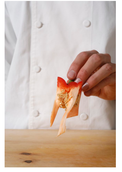
3. Discard the stem and seeds.