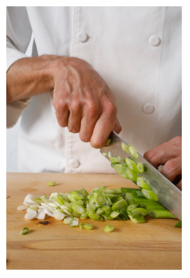
3. Keep the green onions tightly bunched while slicing. Continue slicing until you reach the end of the bunch.