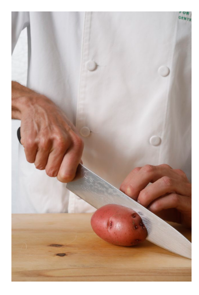
1. Slice a washed potato in half lengthwise.