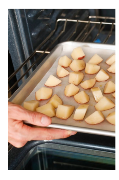
6. Place in oven to roast, rotating pan halfway into cooking.