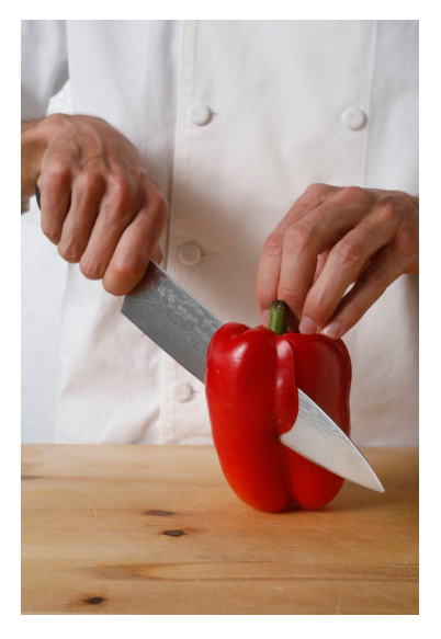
1. Hold the pepper with the stem pointing up. Start about 1/2-inch away from the stem, and slice off one quarter of the pepper, curving the knife to avoid the seeds and the white pith inside the pepper.