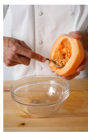
4. Use a large spoon to scoop out seeds.