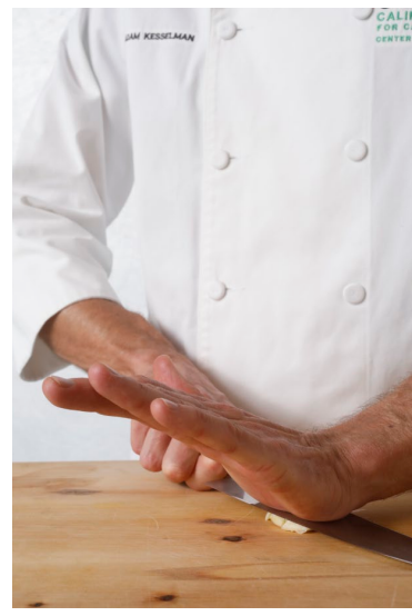
4. Using the same technique as in Step 2, fully crush the garlic clove with the side of a chef's knife against the board.