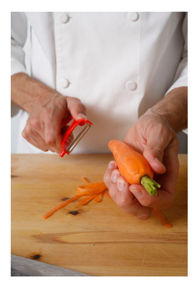
1. Peel the carrot, if desired.