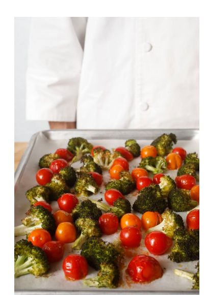
8. Roast until tomatoes have softened and broccoli has become tender and lightly browned, about 15-20 minutes.