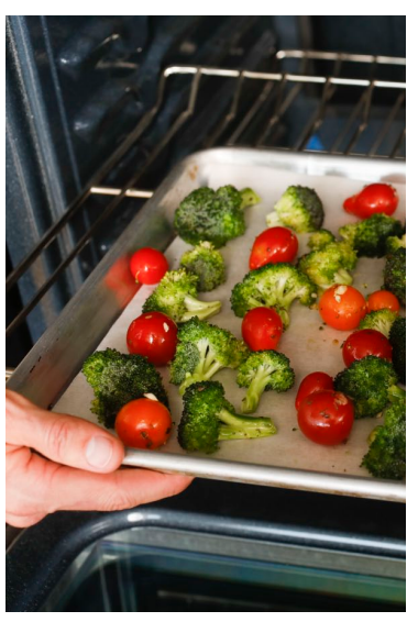
7. Place in oven to roast, rotating pan halfway into cooking.