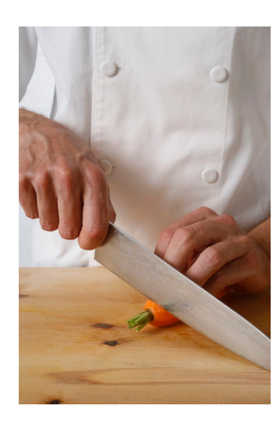
2. Cut off the top of the carrot.