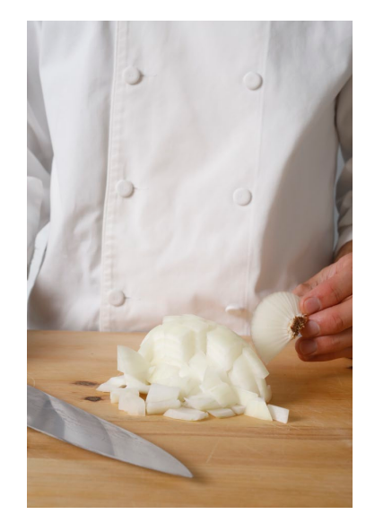
8. Slice all the way down to the root. Discard root.