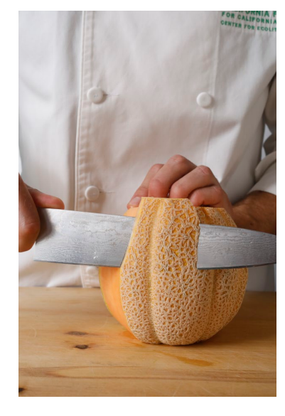
2. Stand the melon on one end. With the knife blade facing away from you, slice under the skin, following the contour of the melon with your blade to remove the skin in ribbons. Work your way around the entire melon.