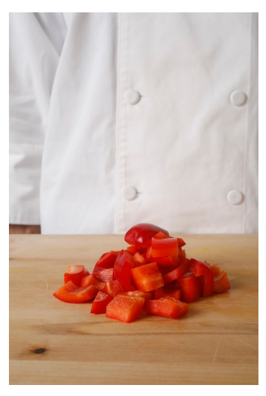
6. Diced bell pepper.