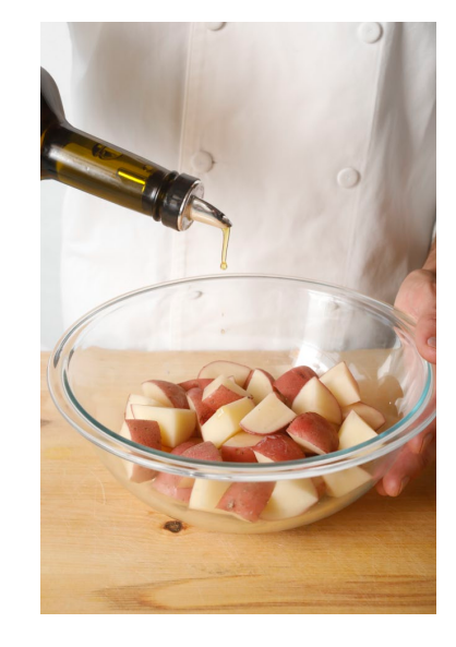
2. Add olive oil.