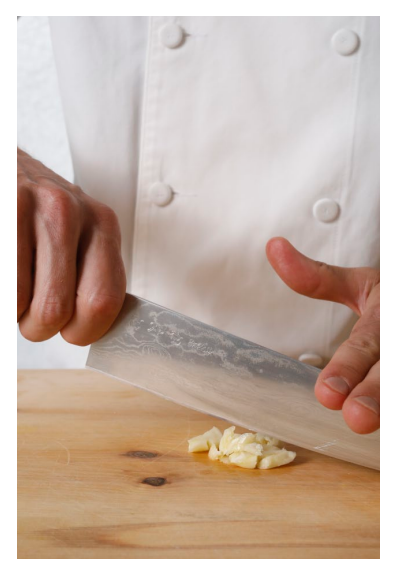
6. To mince the garlic, use the heel of your non-knife palm to hold down the tip of the knife blade. Use the knife handle to move the blade in a rapid chopping motion, keeping the tip of the knife in contact with the cutting board.