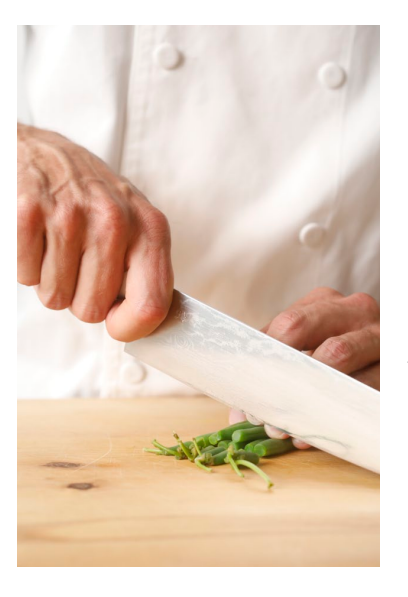
1. Preheat oven to 400 degrees. Cut stems off green beans by aligning small bunches of 6-10 beans and cutting just below the stem.

INGREDIENTS: 1 lb fresh green beans; 1 tsp olive oil; 2 tsp garlic, minced; 3 tbsp lemon juice, 1/2 cup vegetable stock; 2/3 tsp salt; 1/3 tsp pepper