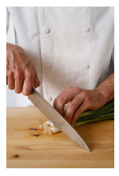
1. Align the roots of a small bunch of washed green onions. Slice off roots.