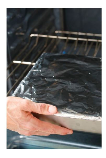
9. Toss beans again and cover with foil. Place back in oven and cook until beans are tender but retain a slight crunch, about 10-15 minutes.