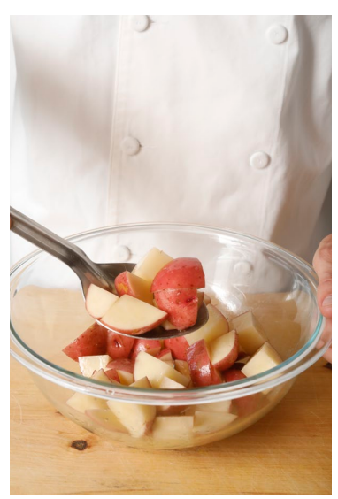
4. Mix ingredients until thoroughly coated.