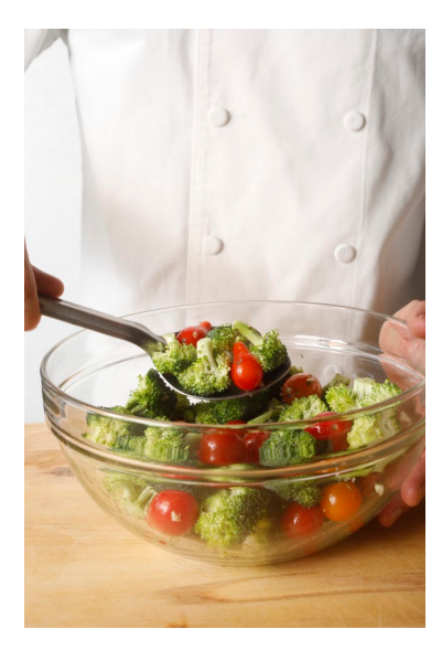
5. Mix the ingredients until they are thoroughly coated with oil.