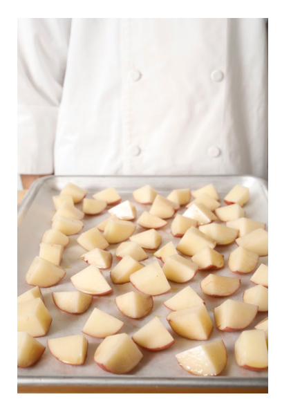
5. Evenly distribute potatoes on a parchment-lined sheet pan, allowing space around each piece for air to circulate.