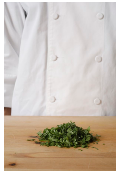
6. Minced cilantro.