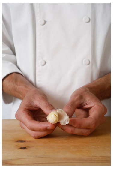
3. Remove the loosened skin from the clove.