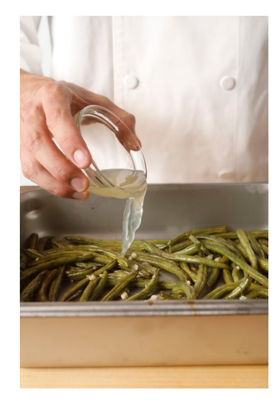
6. Add lemon juice.