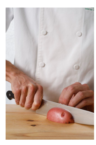
2. With the flat sides down, slice each half in half again lengthwise.