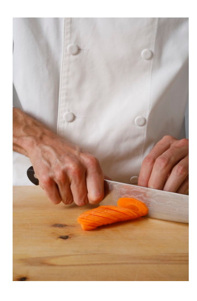
5. Cut diagonally—on the bias—for attractive slices with a large surface area.