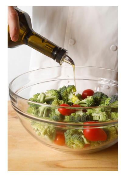
2. Combine the florets and tomatoes in a bowl and add the olive oil.