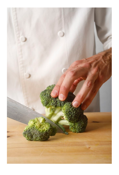
1. Preheat oven to 375 degrees. Cut evenly-sized florets from the broccoli crown.

INGREDIENTS: 2 lbs broccoli florets; 1 qt + 2 cups cherry tomatoes; 1/4 cup olive oil; 1 tsp kosher salt; 3 tbsp garlic, minced; 3 tbsp Italian seasoning