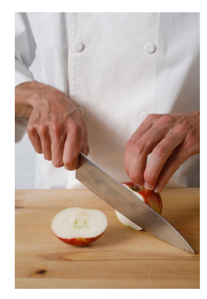
2. Slice, avoiding the core.