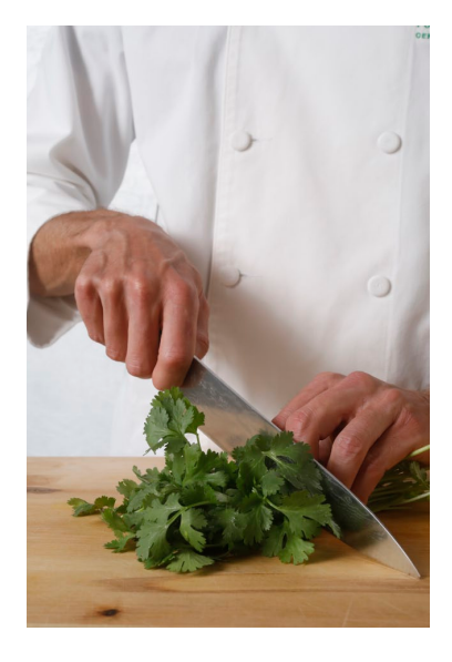
1. Cut stems off washed and bunched cilantro.