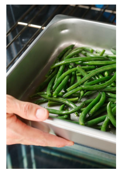
3. Place in oven, uncovered.