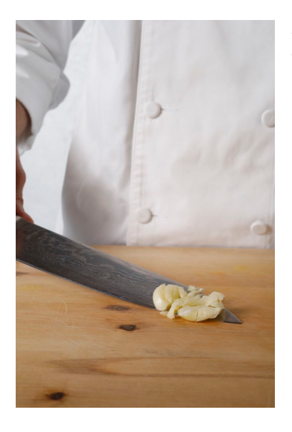
5. Crushed garlic.