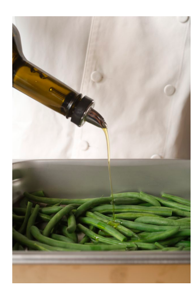
2. Add olive oil and fresh green beans to a hotel pan. Toss to combine.