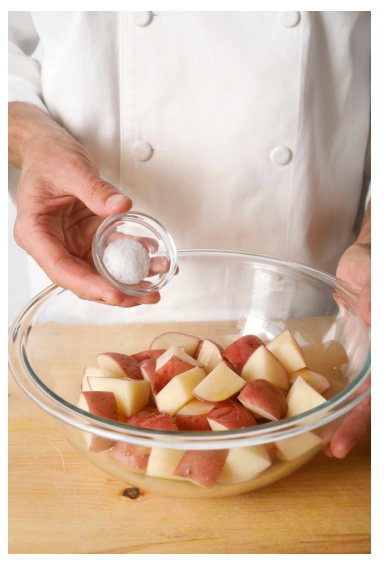
3. Add salt.