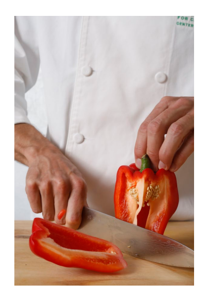
2. Repeat, slicing the pepper into quarters.