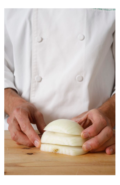
5. Repeat this action, moving up the onion in 1/2-inch increments 1 to 2 times, depending on the size of the onion.