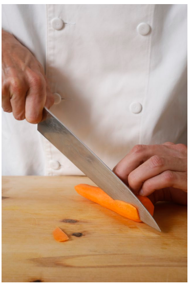
3. To create a flat, stabilizing surface, cut a thin slice off one side of the thick end of the carrot.