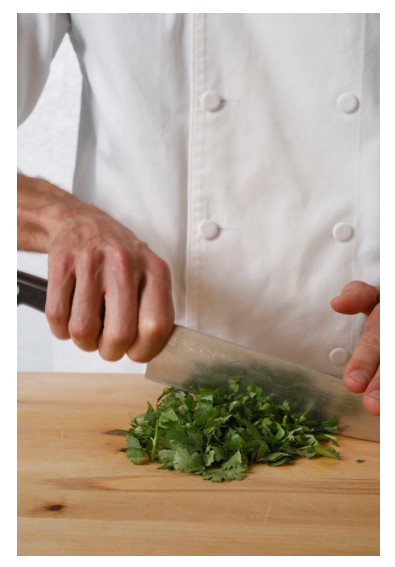
4. To mince, mound the chopped cilantro leaves into a pile. Use the heel of your non-knife palm to hold down the tip of the knife blade. Use the knife handle to move the blade in a rapid chopping motion.