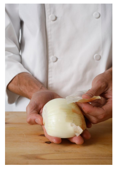
3. Remove the tough outer skin.