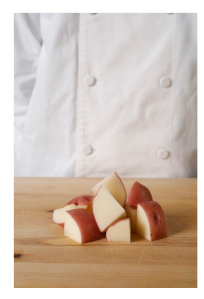
4. Large, evenly diced potato