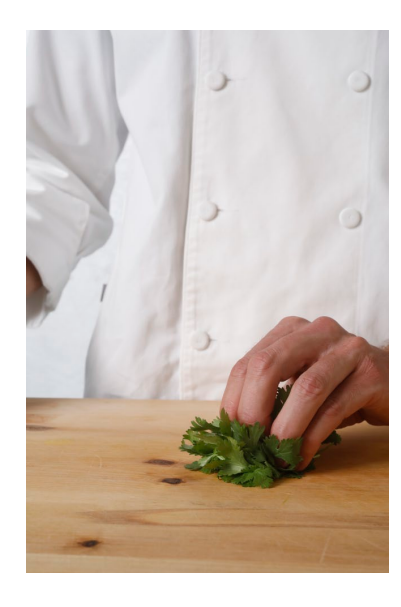
2. Bunch cilantro leaves closely together.