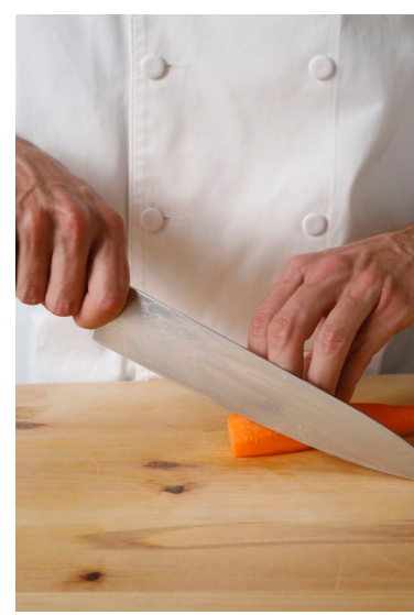
4. Set the carrot flat-side down.