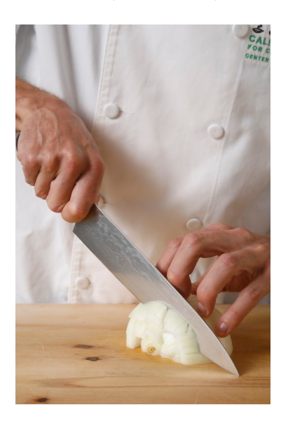
7. Keeping the onion intact, slice across the previous slices in 1/2-inch increments to dice the onion.