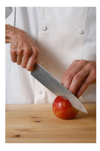
1. Hold the apple with the stem pointing up. Position the knife roughly 1/2-inch from the stem.