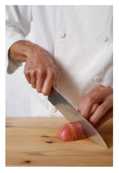
3. Slice the larger pieces into 3/4 or 1-inch pieces.