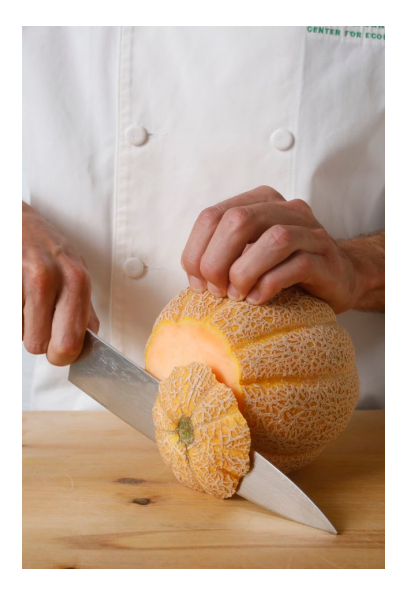
1. Cut off the top and bottom of the melon.