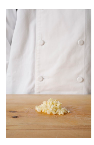
8. Minced garlic.

7. After one pass, mound the garlic into a pile and repeat the mincing motion until the garlic is chopped into small, uniform pieces.