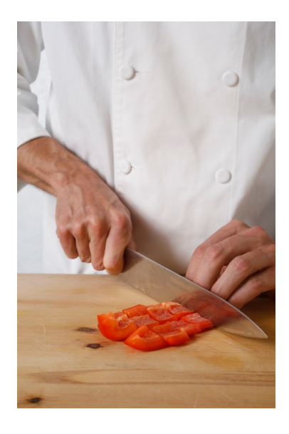
5. Evenly bunch 3 to 4 strips and slice them perpendicularly into 1/2 to 3/4-inch dice.