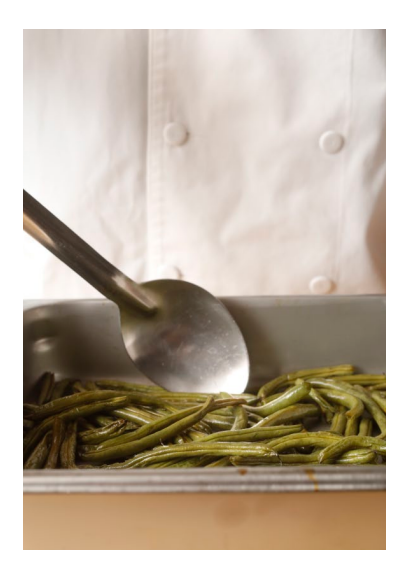
4. Stir green beans 1-2 times until they begin to brown, about 8-12 minutes, depending on your oven.