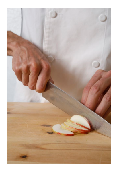
5. Slice each piece to desired thinness.