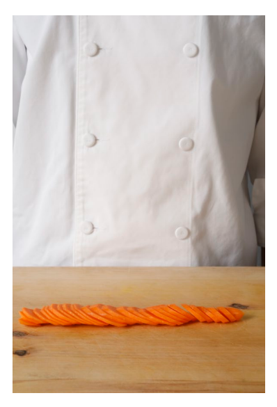
6. Sliced carrot.