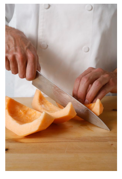
6. Slice again, into eighths.