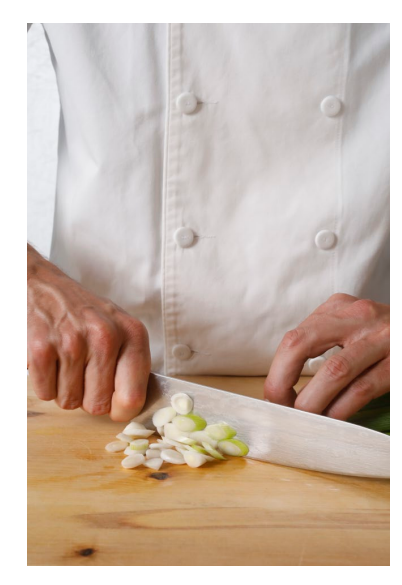
2. Slice green onions on the bias to create an attractive shape.