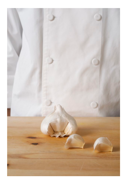
1. Remove the cloves from a head of garlic.