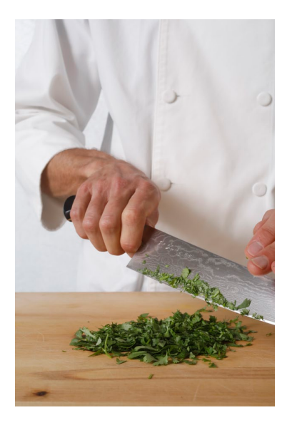
5. After one pass, mound the cilantro into a pile and repeat the mincing motion until the cilantro is minced to the desired size.