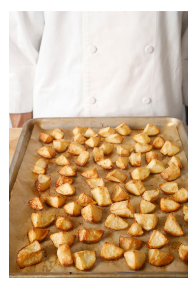
7. Roast until the exterior is nicely browned and the interior is tender, approximately 30 minutes. Toss with rosemary for added flavor.