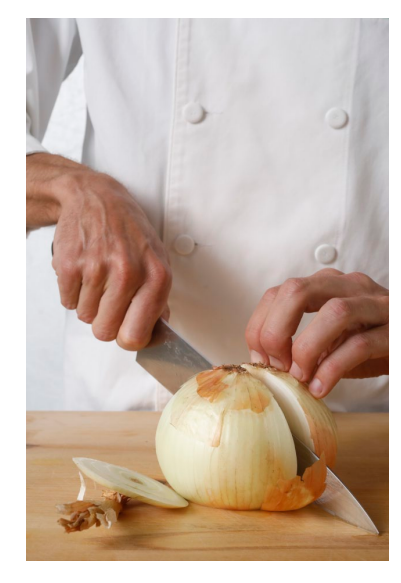
2. Place the onion top-side down and cut it in half through the root.