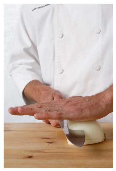
4. Place open-palm hand on top of the onion half to stabilize it. Starting 1/2-inch above the cutting board, make a horizontal slice toward the root, being careful not to cut all the way through.