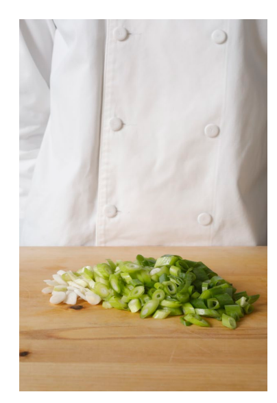
4. Sliced green onions.