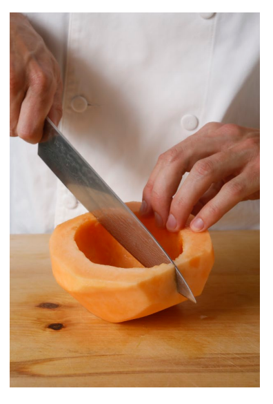
5. Cut the melon lengthwise into quarters.