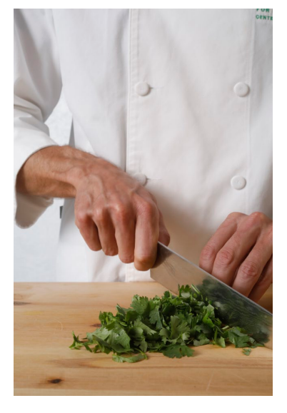
3. Chop leaves to desired size.