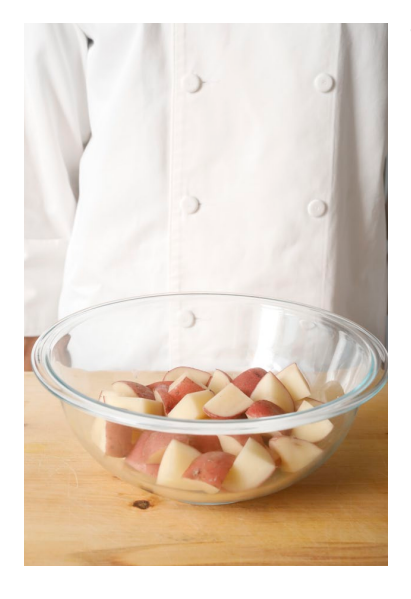
1. Preheat oven to 425 degrees. Place potatoes, cut in a large 3/4inch dice, into a bowl.

INGREDIENTS: 4 lbs red potatoes; 3 tbsp olive oil; 2 tsp kosher salt; 1 tbsp fresh rosemary, chopped (optional)