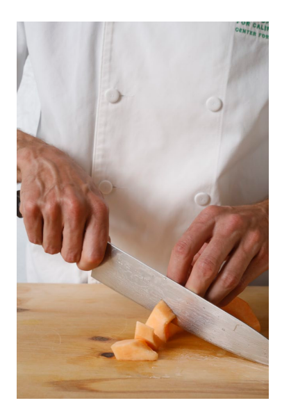
7. Cut each slice into a large dice.