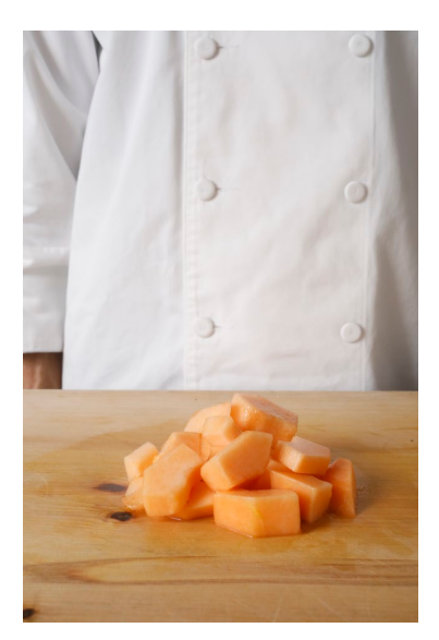
8. Diced melon.