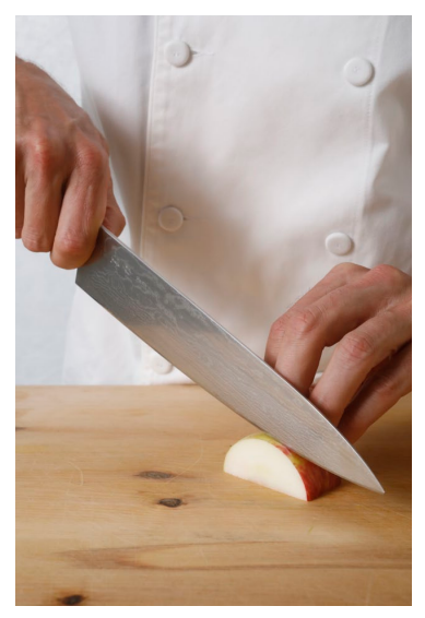
4. Place each piece on the cutting board skin-side up. Use a cutting board designated for fruit to avoid the fruit absorbing other food flavors or smells, like garlic.