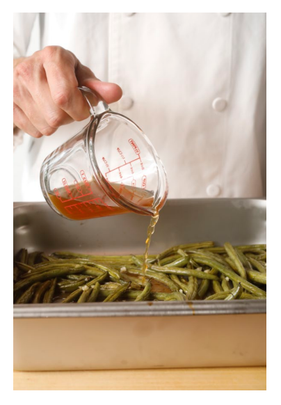
7. Add vegetable stock.