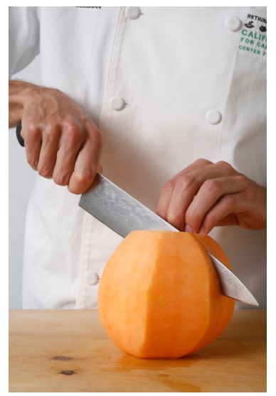
3. Cut the melon in half.