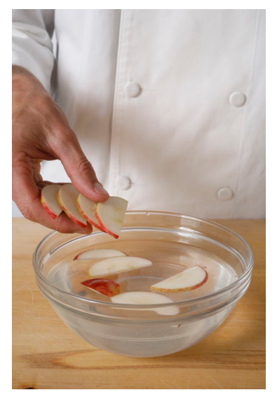
6. To avoid browning, dip sliced apples in fruit acid dilution (page 40) to prevent oxidation.