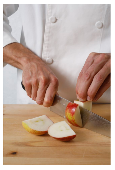
3. Turn the apple one quarter turn and slice again. Repeat until you have cut four pieces away from the core.