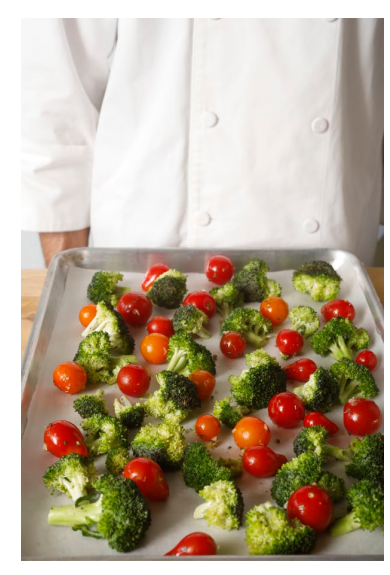
distribute the vegetables on a parchment-lined sheet pan, allowing space around each vegetable for the air to circulate.